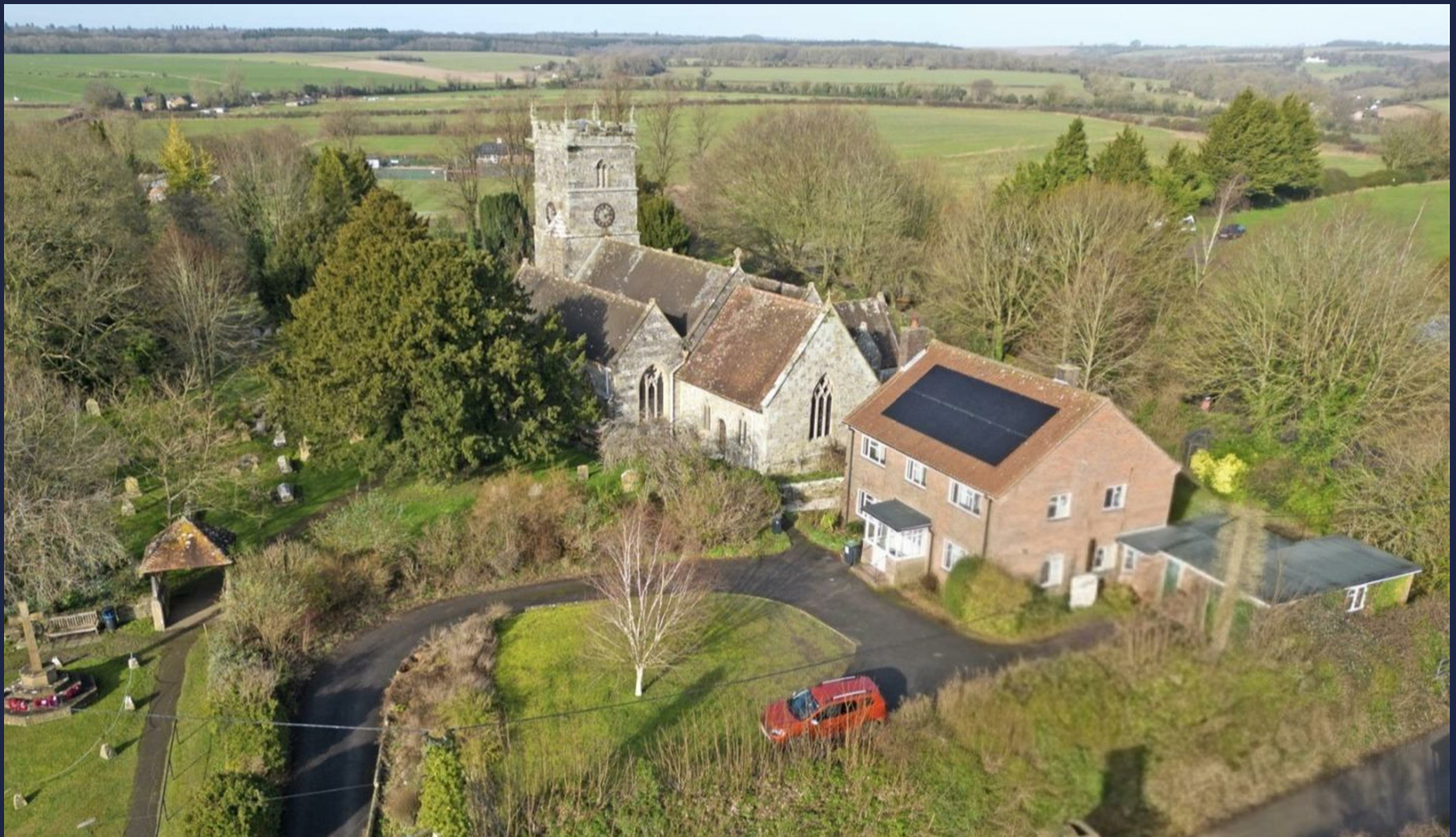
The Vicarage, 60, High Street, Sixpenny Handley, Salisbury